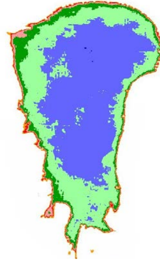
Little Pelican Lake